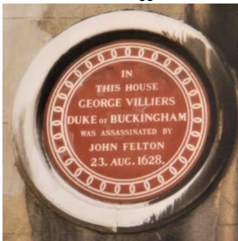
The commemorative plaque